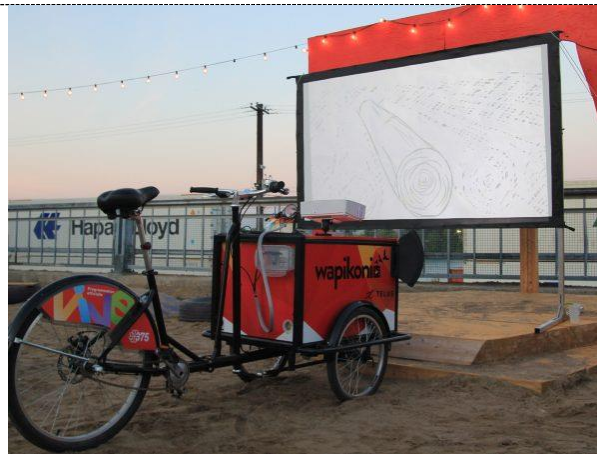
Wapikoni's Canadian Indigenous short films shine in Frankfurt