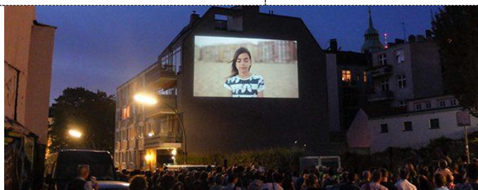
A Wall is a Screen: Frankfurt again – a guided city tour and short film projections