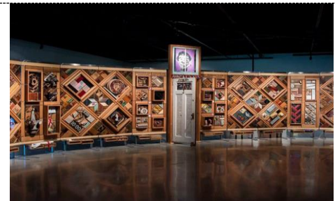
Screening of the films "Enfances oubliées" and "Picking up the Pieces: the Making of the Witness Blanket"

© Image extraite du film Shivers , de David Cronenberg. 1975.