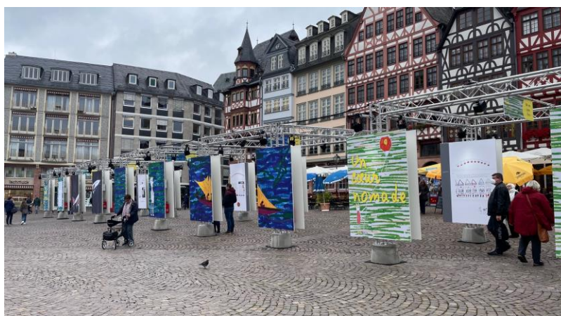
Un cœur nomade – Photo Exhibition