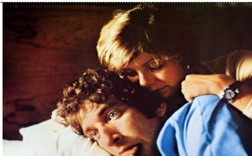
Le Canada à l'écran

© Image extraite du film Shivers , de David Cronenberg. 1975.