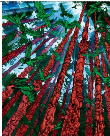
Seeing the Trees for the Forest