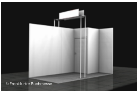
System stand FUN 8 sqm, corner position

Instead of going to various external providers, you can easily order your additional equipment from one personal contact: fairconstruction@messefrankfurt.com