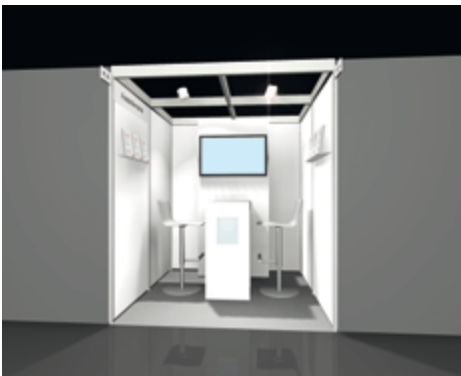
4 sqm System Stand Smart