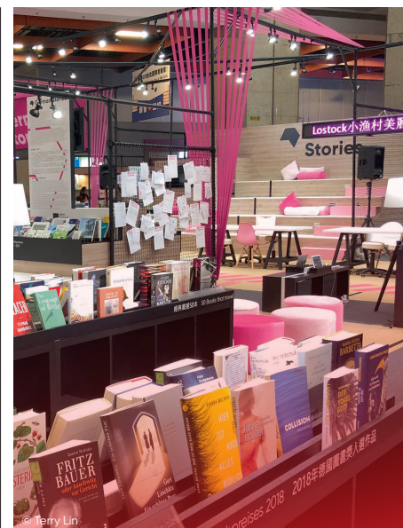
German collective stand at Taipei International Book Exhibition 2019

On 18 and 19 May we'll be attending the Cannes Film Festival with a small group of industry professionals. While the stars strut the red carpet, our participants can meet film producers at exclusive networking events and promote selected books at one of the world's leading film festivals. They will also receive advice from our own film expert and benefit from accreditation for the festival itself and for the prestigious Marché du Film , including the two-day pitching event, Shoot the Book! Participation is open to publishers and film agents from German-speaking countries as well as countries due to be Guests of Honour at Frankfurter Buchmesse: Canada, Spain, Slovenia and Italy. The small number of places available will be allocated by a jury. A similar tour will be organised in September for the Toronto International Film Festival.